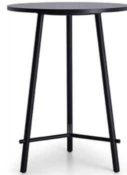
* Table top shown for demonstration purposes only.

Suits 600 – 800mm~ Table Top Diameter Sizes